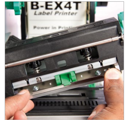
Snap-in printhead reduces maintenance downtime to a minimum