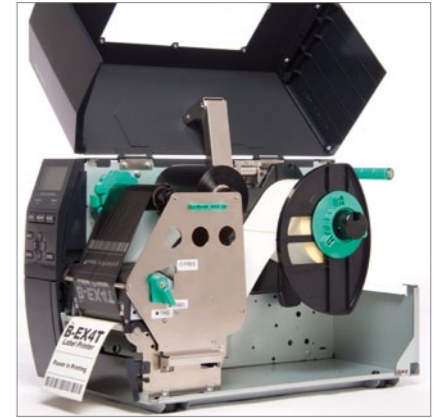
Easy access for maintenance and consumables loading